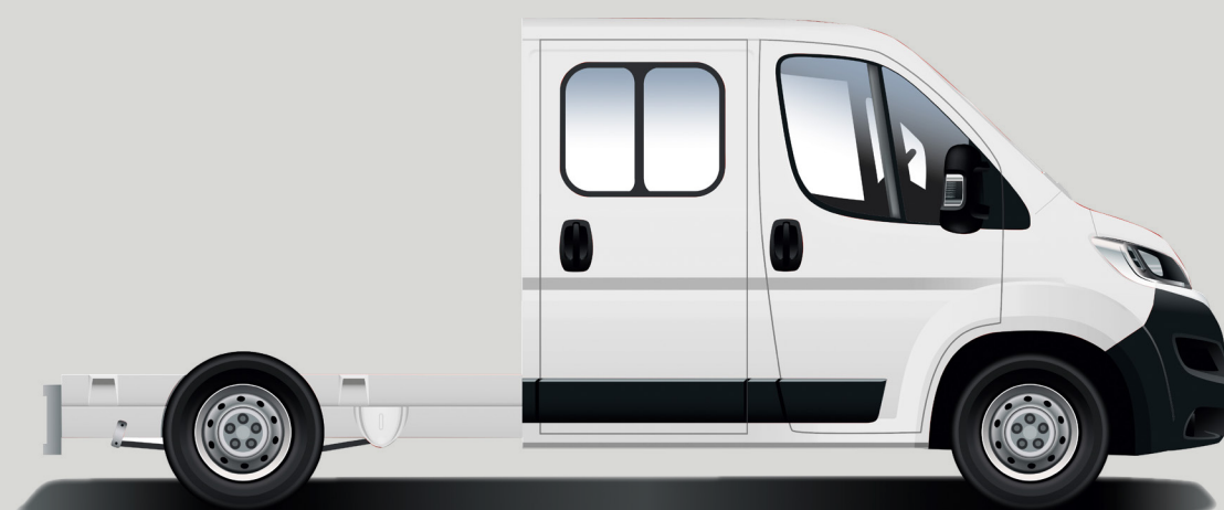
Citroën Relay Chassis Crew Cab

All information and prices correct at time of publication, but are subject to change at any time without prior notice (which may occur as a result of matters including, but not limited to, any changes in legislation and/or any changes by the government). Please see our Prices and Specifications brochures or contact your local Citroën Retailer for the most up-to-date prices and specification details for all models. CO 2 figures above are for a standard vehicle without any additional optional equipment. The addition of optional extras could increase the certified CO 2 emission output.