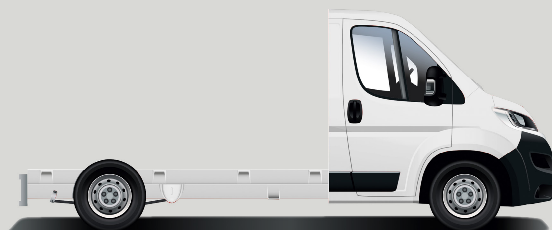
Citroën Relay Chassis Cab